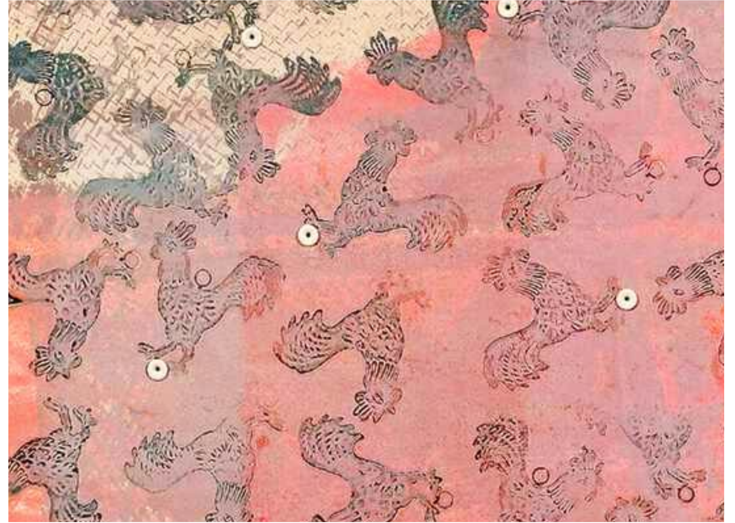
Repetition & pattern in Kendra Frorup's work