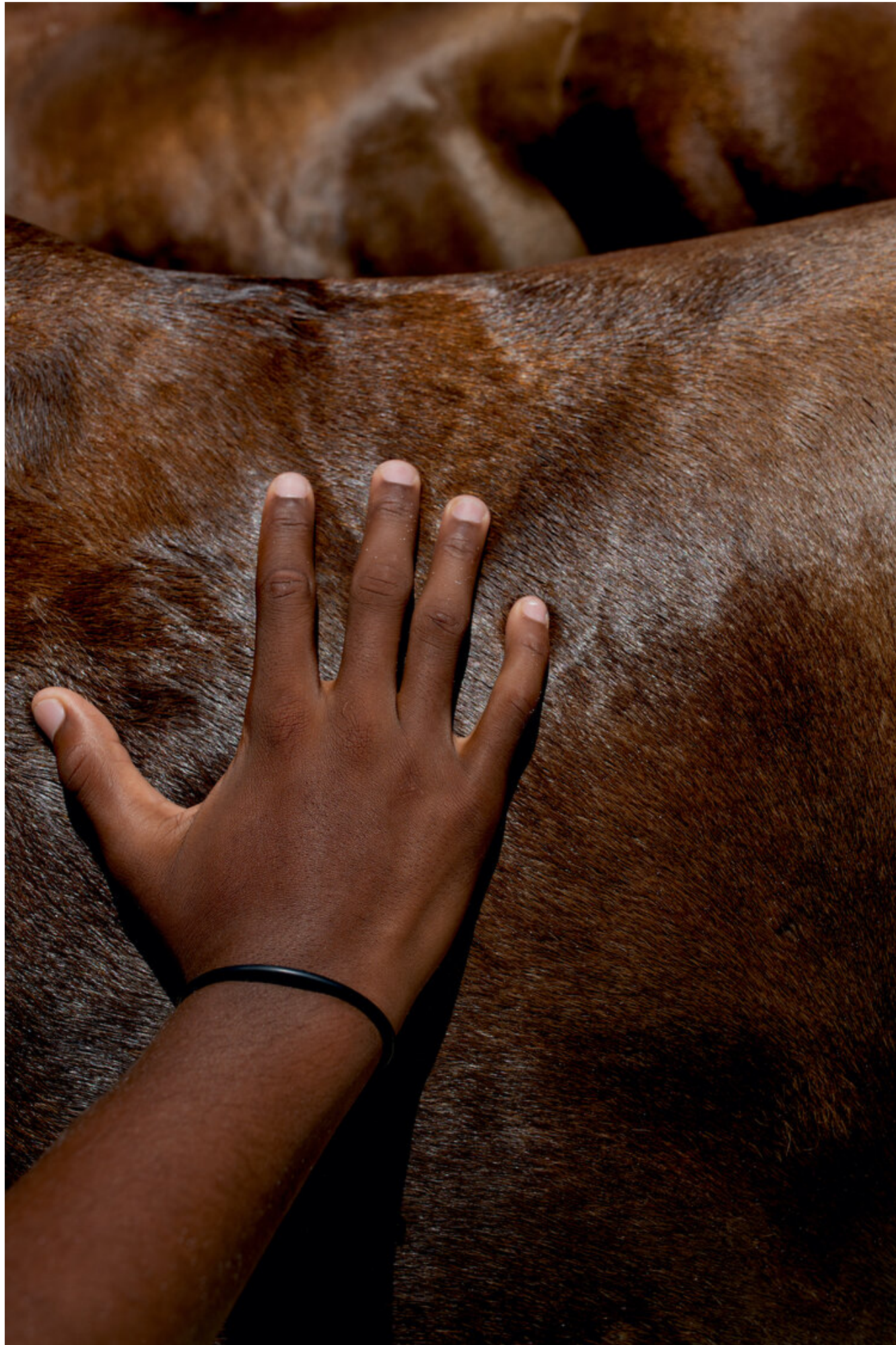
Bj's Hand on Horse, 2019