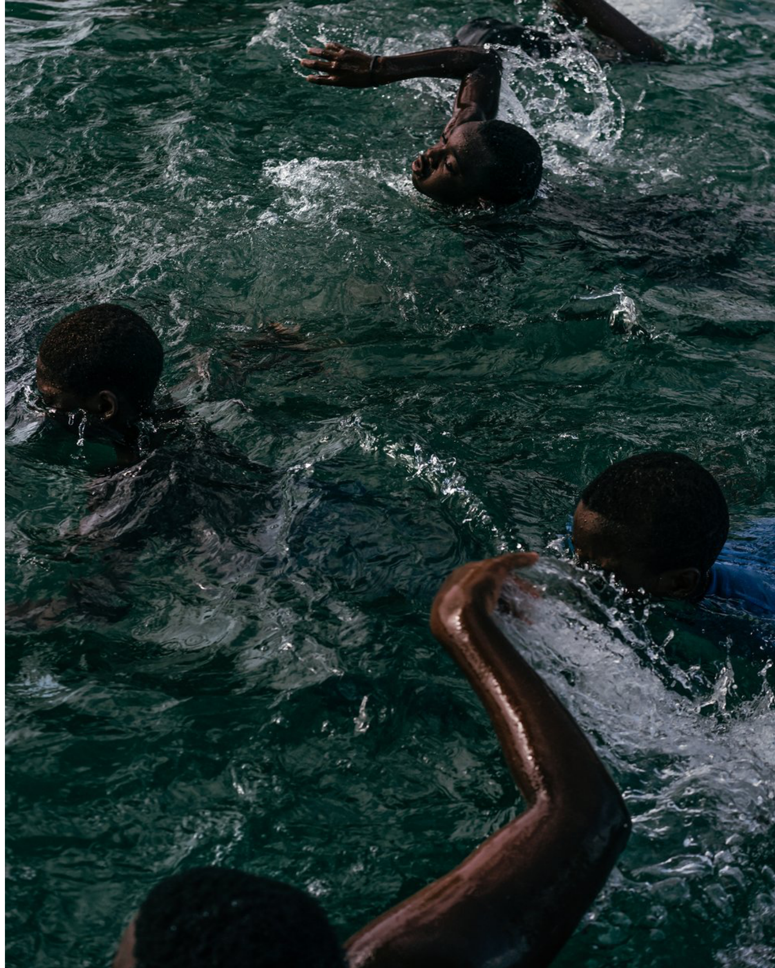
Arawak Cay, 2022