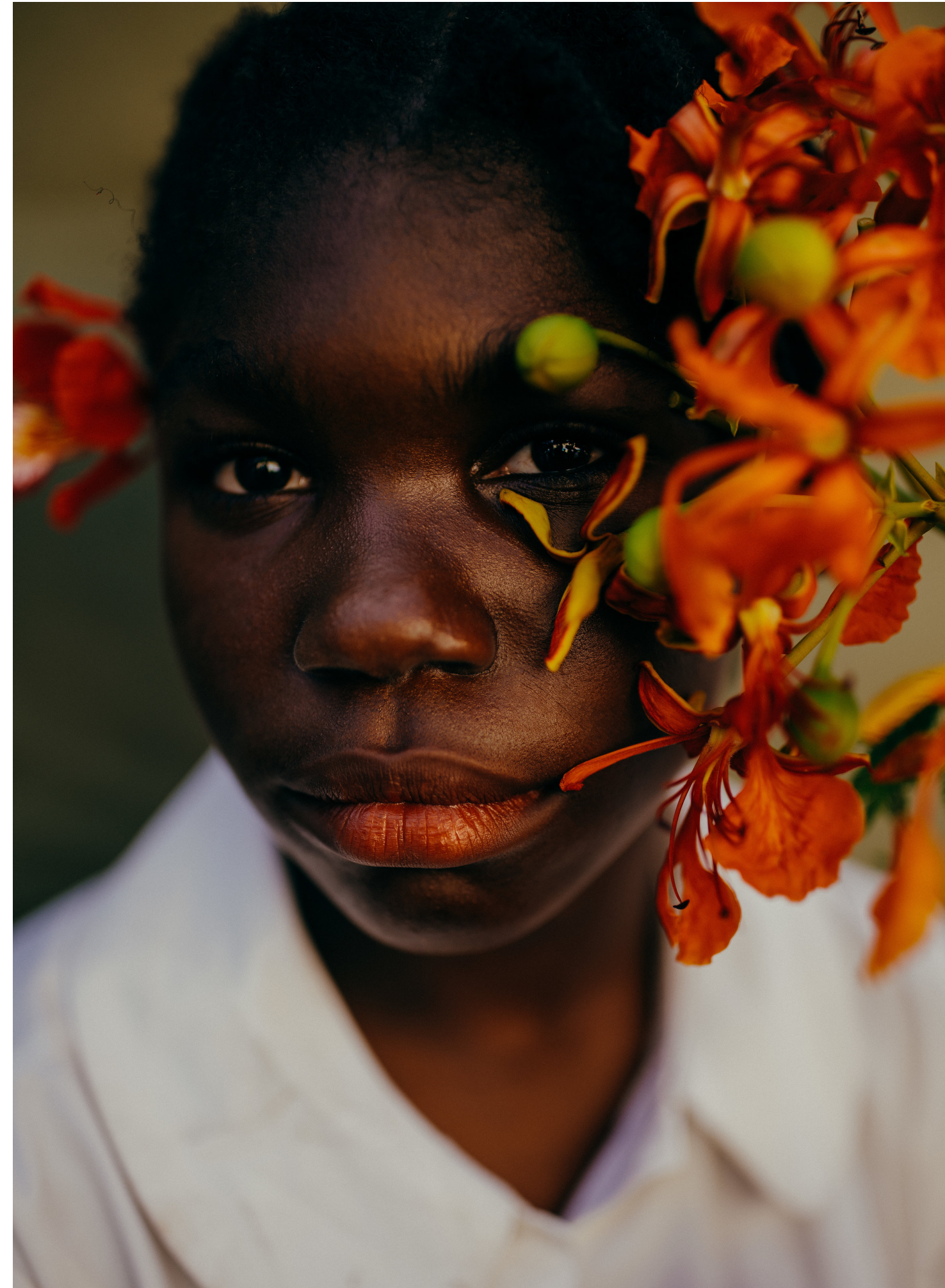
Poinciana Princess, 2019